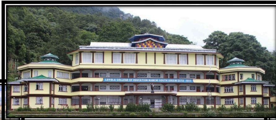
Loyola College of Education South Sikkim Namch 2004-2005