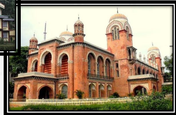
Madras University 2005-2007