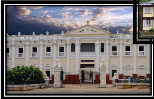
MPC COLLEGE, BARIPADA 1989-1991